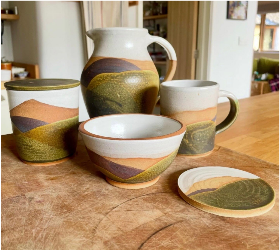
Cover Picture and opposite: Andrew Plaistow Above: Andrew's South Downs' motif pottery